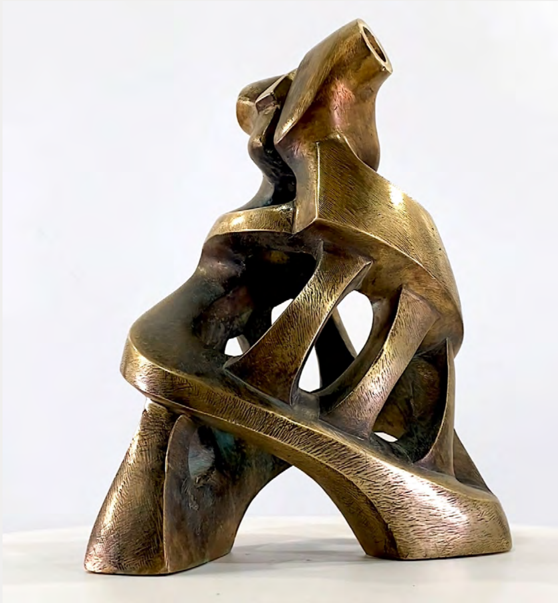
Oscar Martín de Burgos Re-encounter, Edition 1/8, 2023 Brass 28.5 x 29 x 15 cm $34,800 AUD