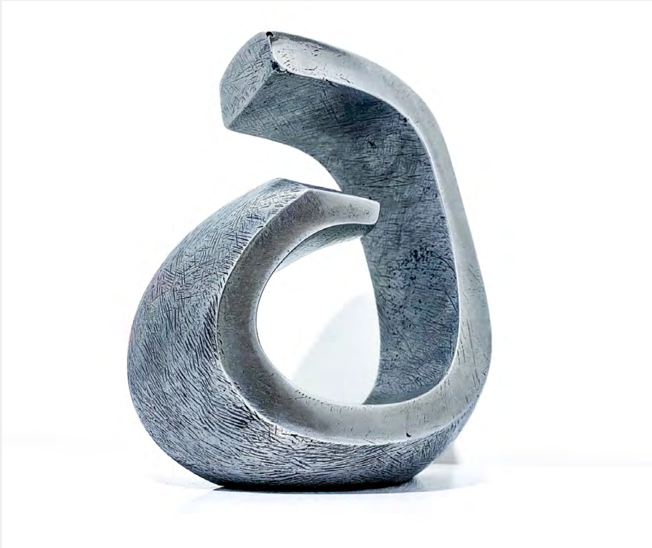
Oscar Martín de Burgos 'a' Breaking the Ice, Edition 1/8, 2025 Aluminium 29.5 x 22 x 16 cm