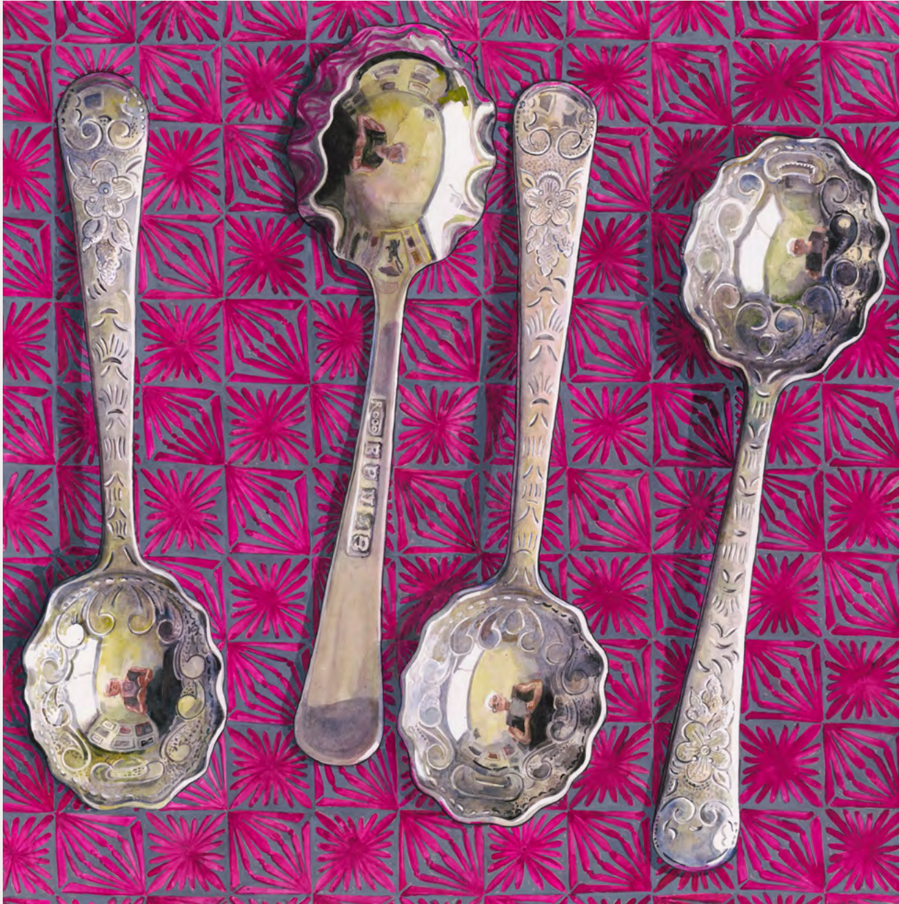
Margaret Ackland Fancy Spoons , 2025 Watercolour on paper 95 x 95 cm paper, 115 x 115 cm framed $8,000 AUD