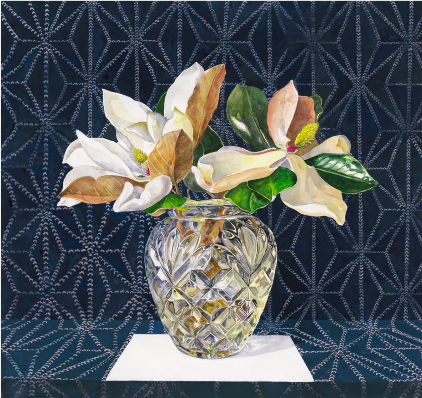
Margaret Ackland Magnolia Season 2025 Watercolour on paper 95 x 95 cm paper, 115 x 115 cm framed