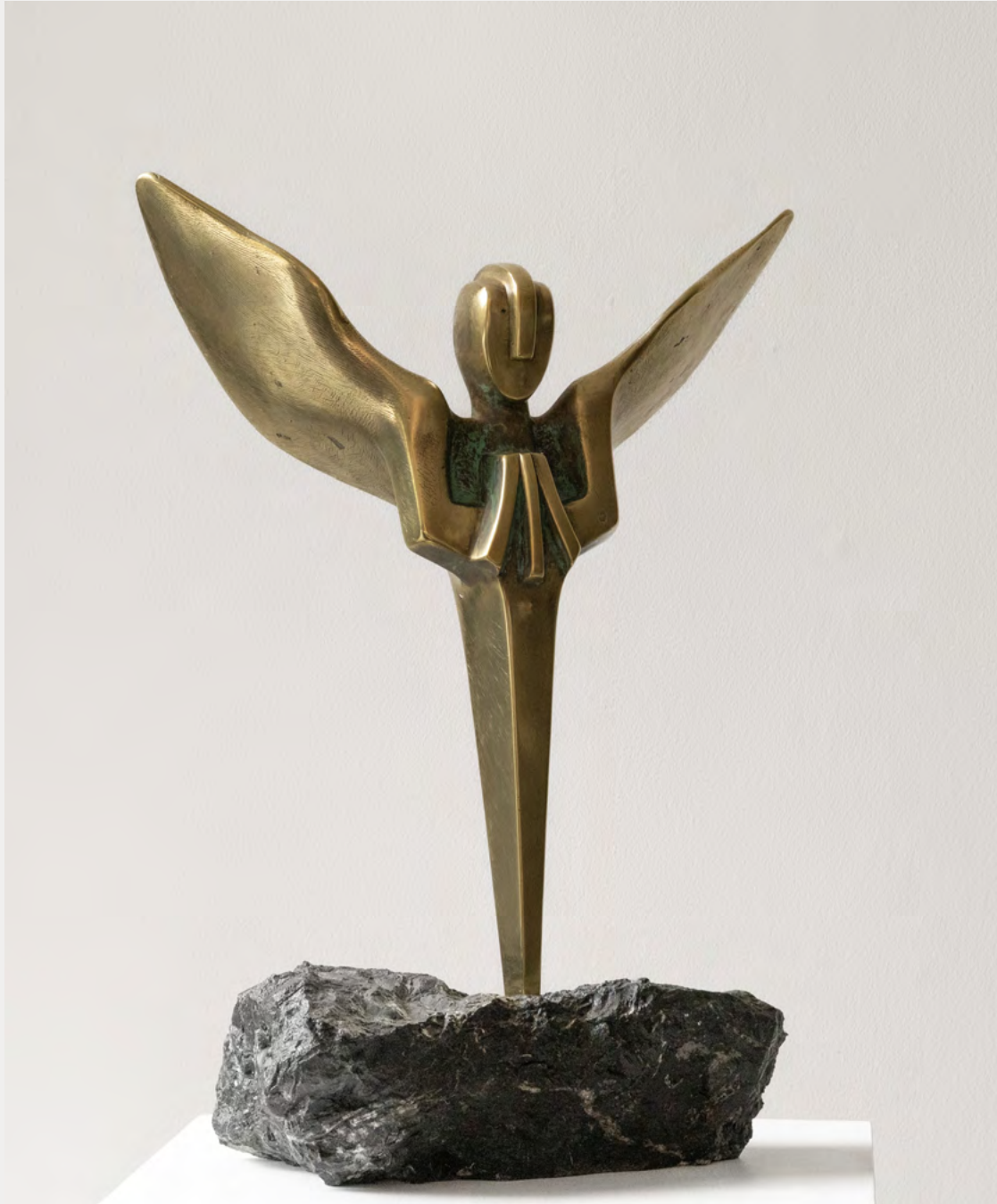
Oscar Martín de Burgos Archangel Michael, Edition 1/8, 2024/2025 Brass and Stone 55 x 39 x 21 cm, 20 x 22 x 33 cm base